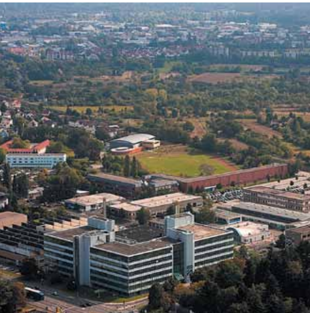
Manroland Sheetfed headquarters, Offenbach, Germany.