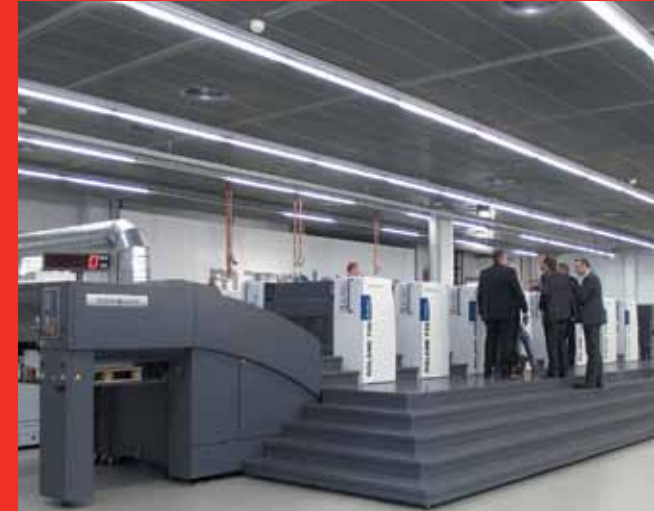
Manroland Sheetfed Print Technology Center.